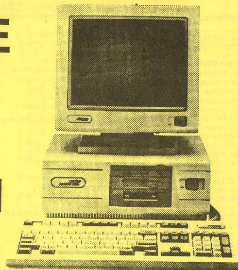
The New COMPAQ DESKPRO 386s.

Now you can accelerate straight to 80386 power and speed. Introducing the innovative COMPAQ 386s. The affordable, high-performance personal computer that brings an even wider range of general business users up to speed with the new 80386 technology. In a sleek package designed with only the features you really need. You'll get: